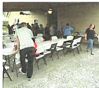
Cookout before the banquet

SENDING CHURCH: White Oak Baptist Church PO Box 114 Nancy, KY 42544