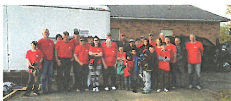
Builders at Shady Grove in Star City