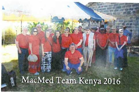
MacMed Team Kenya 2016